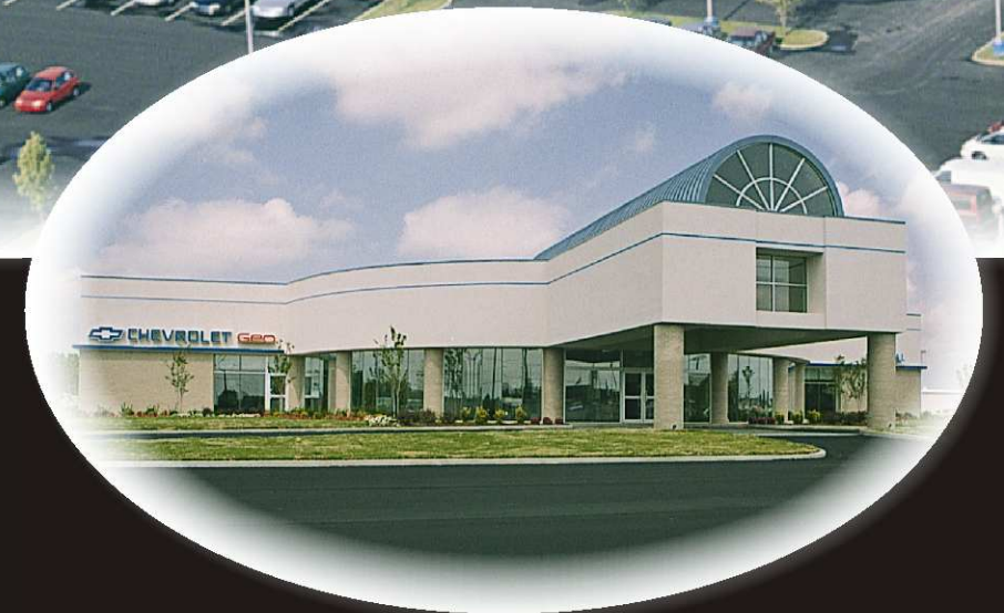
Central Chevrolet; B. B. Vance & Sons, Inc., builder; Little & Maddox Architects.