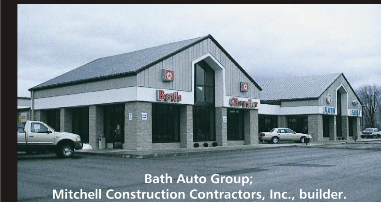
Bath Auto Group; Mitchell Construction Contractors, Inc., builder.