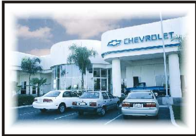
Liberty Chevrolet; G and W Builders, builder.