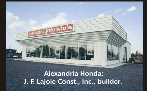
Alexandria Honda; J. F. Lajoie Const., Inc., builder.