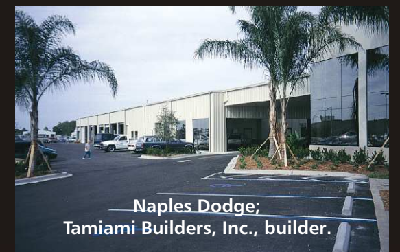
Naples Dodge; Tamiami Builders, Inc., builder.

...and provides energy efficiency and lower maintenance costs.