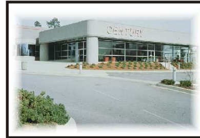
Century Acura; R. T. Murrell Const. Co., Inc., builder; Design Collaborative, architect.