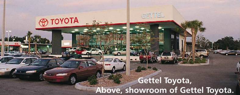
Gettel Toyota, Above, showroom of Gettel Toyota.